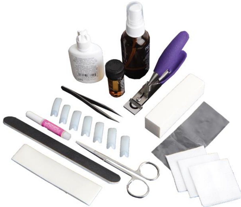
© Milady, a part of Cengage Learning. Photography by Dino Petrocelli.

MILADY STANDARD COSMETOLOGY INSTRUCTOR SUPPORT SLIDES