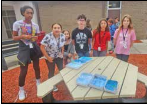
Leadership students with their waterproof fish tanks