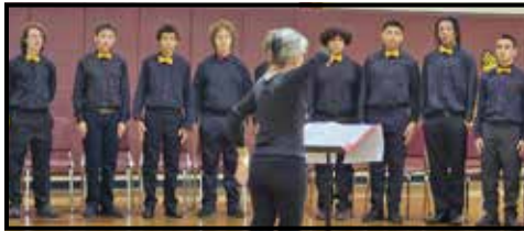
7th and 8th grade Boys Chorus