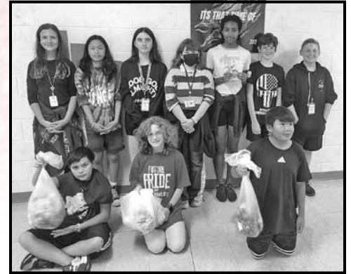
SGA students after their outside clean-up day