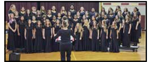
7th and 8th grade Girls Chorus